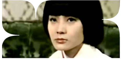
Mai Ling.

17:30 to 18:00 – Blickle Kino Mai Ling Speaks #7 with Guests.