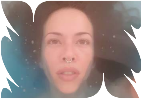
Ironica los Culos.

13:00 to 15:00 – Sculpture Garden Silent University in Austria, WIESE - Wie Es Ist and Versatorium: Translation: Të polli gjeli. (Dir wurde vom Hahn gekalbt.) Workshop on translation.