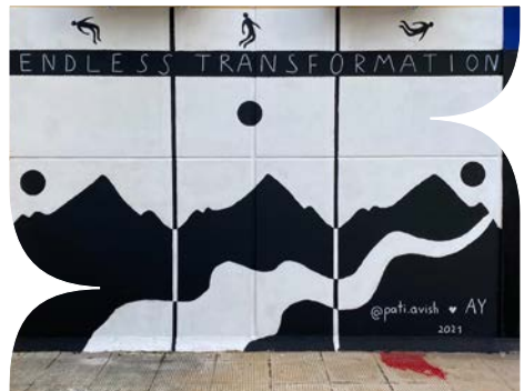
Artwork: ©Pati Avish