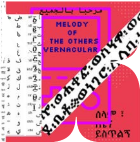
Artwork: ©MELODY of the OTHERS VERNacular